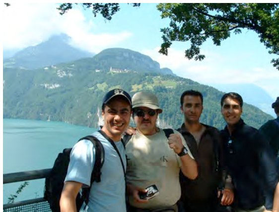
Jordanian participants enjoying the Swiss countryside